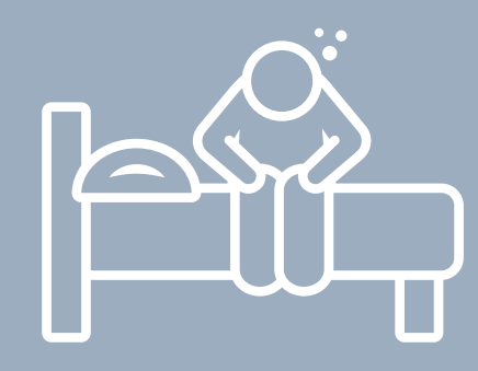
Difficulty staying asleep